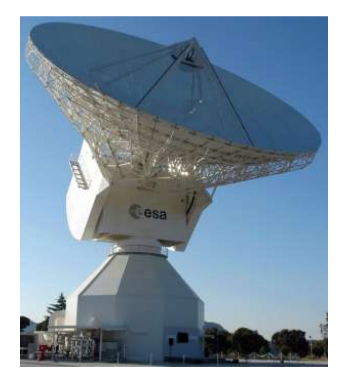
Fig. 2 ESA's 35m DSA-2, located at Cebreros, Spain

European Space Agency (ESA) and the operations are headquartered by the European Space Operations Centre (ESOC) in Darmstadt, Germany. The ESTRACK network is used to communicate between the mission controllers and ESA spacecraft as well as to command, monitor, and control them during launch, and their subsequent orbit. Each ESTRACK centre has different capabilities and supports different missions. The ESTRACK station in Santa-Maria is used to track Ariane launches and has capabilities to track Vega and Soyuz launches from the ESA launch pad in French Guiana [2].