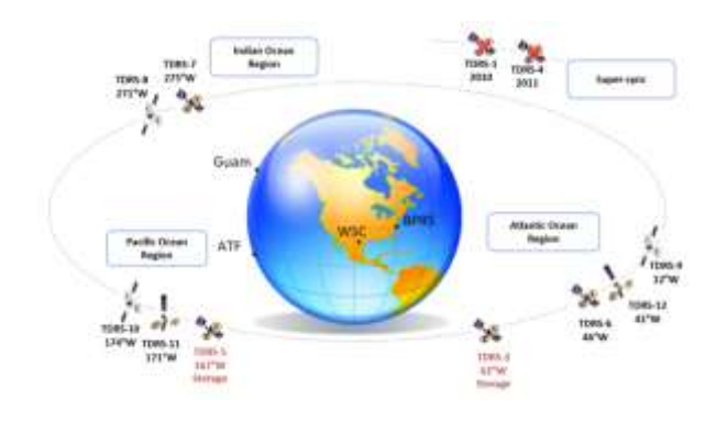
Fig. 4 NASA's TDRS satellite network

NASA currently uses a constellation of nine communications satellites in a geosynchronous orbit (GSO), called a Tracking and Data Relay Satellites (TDRS). These satellites as a series of repeater stations in connection with NASA's Near Earth Network (NEN) ground stations to provide near continuous space communications and increases the data transfer between NASA's satellites in low Earth orbits (LEO), as well as the Hubble Space Telescope and the International Space Station (ISS). The satellites are placed approximately 120 degrees apart to provide maximum coverage over the earth, for the longest possible continuous time. Three generations of the TDRS project have been made operational with the key differences between the generations being the communications technology being used. This TDRS system has been designed to enable increased communication between satellites in LEO and MEO, but does not provide any data link to those in GEO or other higher orbits. Each of NASA's TDRS satellites cost between $250 million and $300 million to build, not including the launch costs. The total cost of building and launching the TDRS constellation is upwards of $7 billion USD [7, 8].