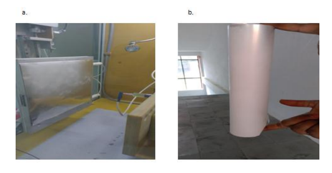
Fig. 1: a) Eletrospinning process, b) Nanofiber sheet

The nanofibers were produced when electrospinning method was followed. Fig. 1 is the images of the electrospinning process being done and the final product respectively.